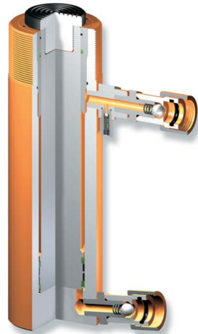
Cross section view